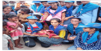
Care for the