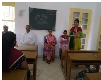
Department of English