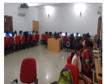
Department of Comp. Sc.