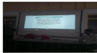
Resume preparation workshop: 17.09.2018