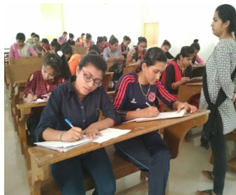
Preparatory Training for Competitive Examinations