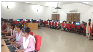
Data-Entry Operator Course (NSQF)/ Quiz