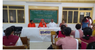
Workshop on Indian Culture