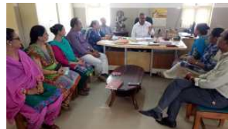
Faculty Development Programme through Video-conferencing