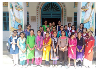
Educational visit to Bharat Mandir