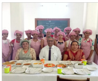
Department of Home-Science