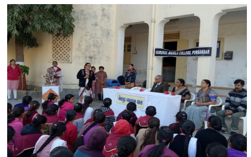
SPORTS WEEK INAUGURATION