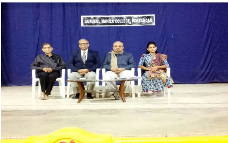
FELICITATION BY YUVA VIKAS TRUST